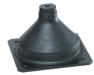
VIB HD 45