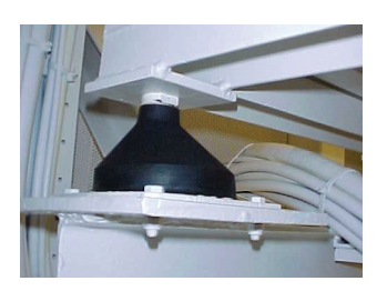
Vibration and shock isolator